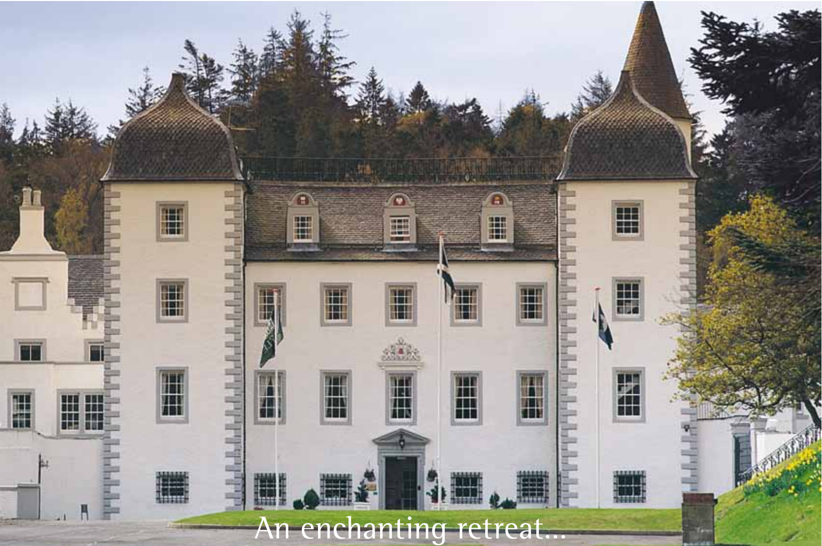
An enchanting retreat...